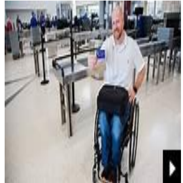
TSA Cares at BWI

https://www.youtube.com/watch?v=mHo8BMAHx00