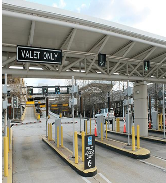
Valet Parking Service at BWI